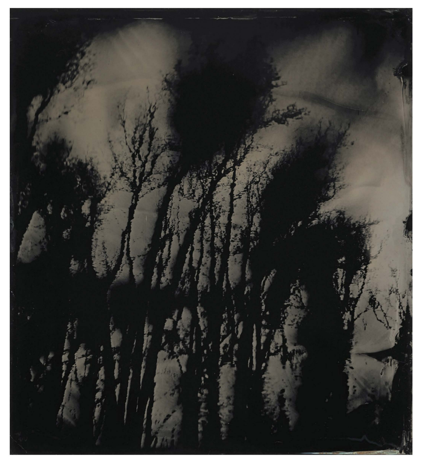
"Blackwater 20," 2008–2012. Photograph by Sally Mann