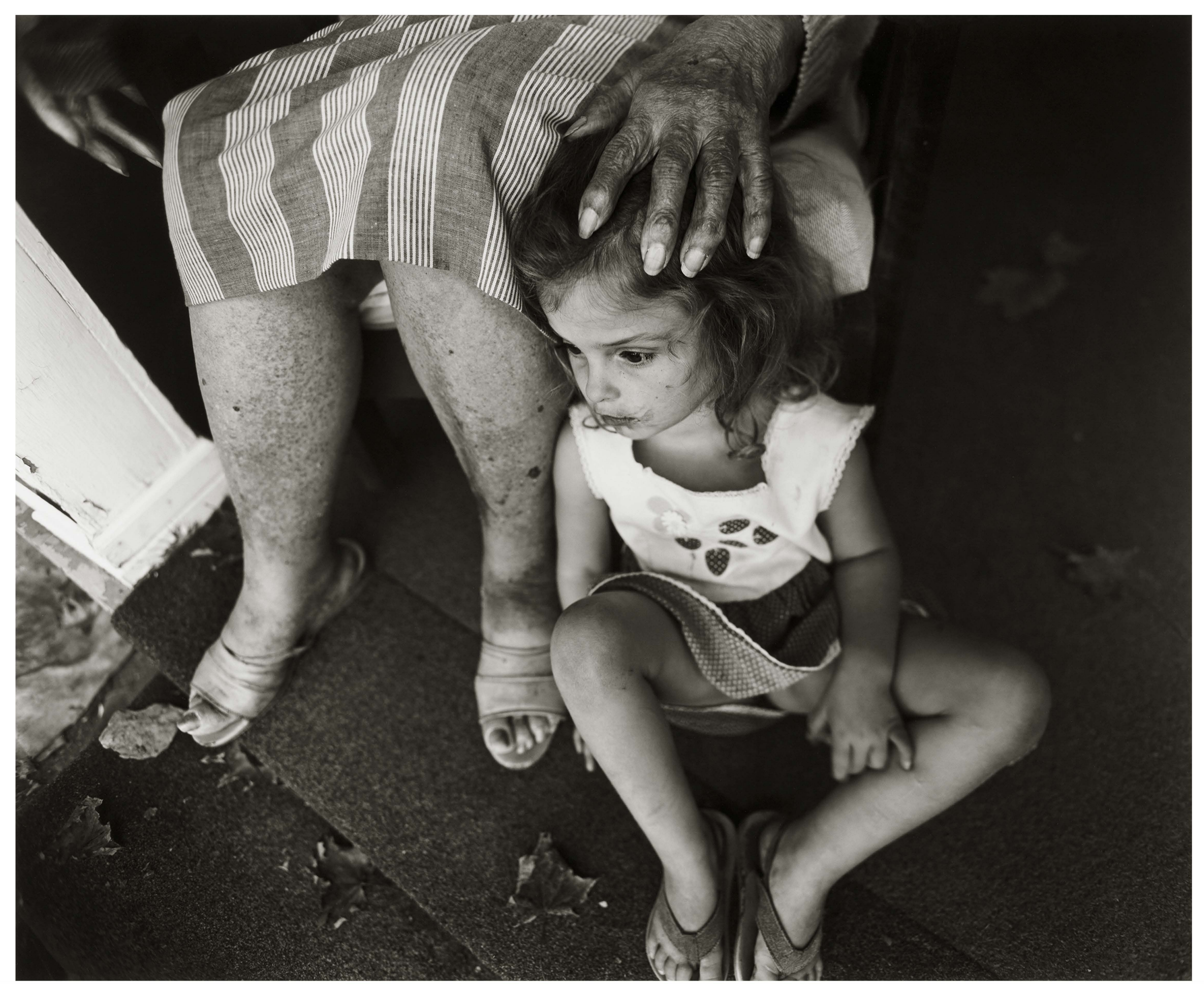
"The Two Virginias #1," 1988. Photograph by Sally Mann

Who like Thyself my guide and stay can be? Through cloud and sunshine, O abide with me!