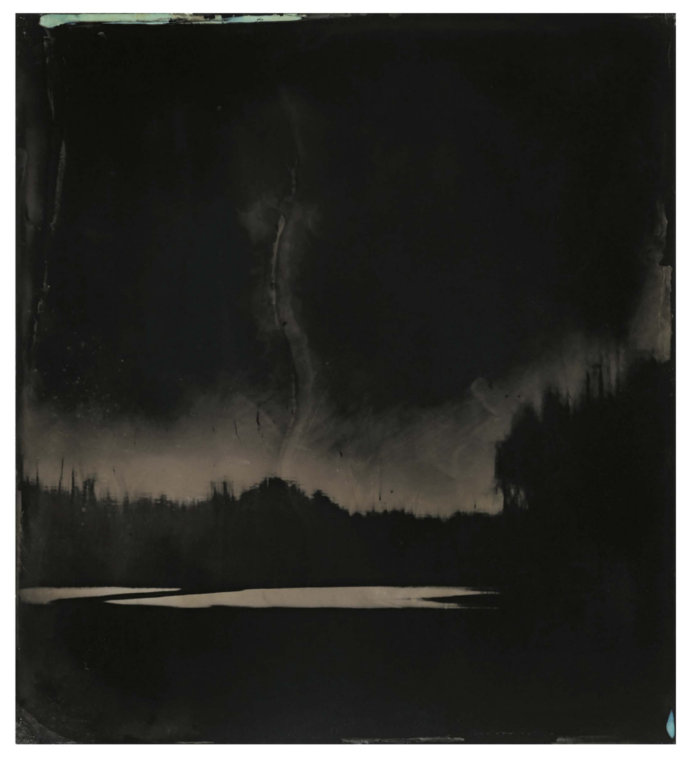
"Blackwater 9," 2008–2012. Photograph by Sally Mann